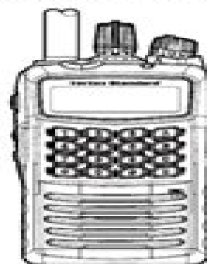
16 key Type

While we believe the information in this manual to be correct, VERTEX STANDARD assumes no liability for damage that may occur as a result of typographical or other errors that may be present. Your cooperation in pointing out any inconsistencies in the technical information would be appreciated.