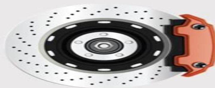
BRAKES &amp; ROTORS