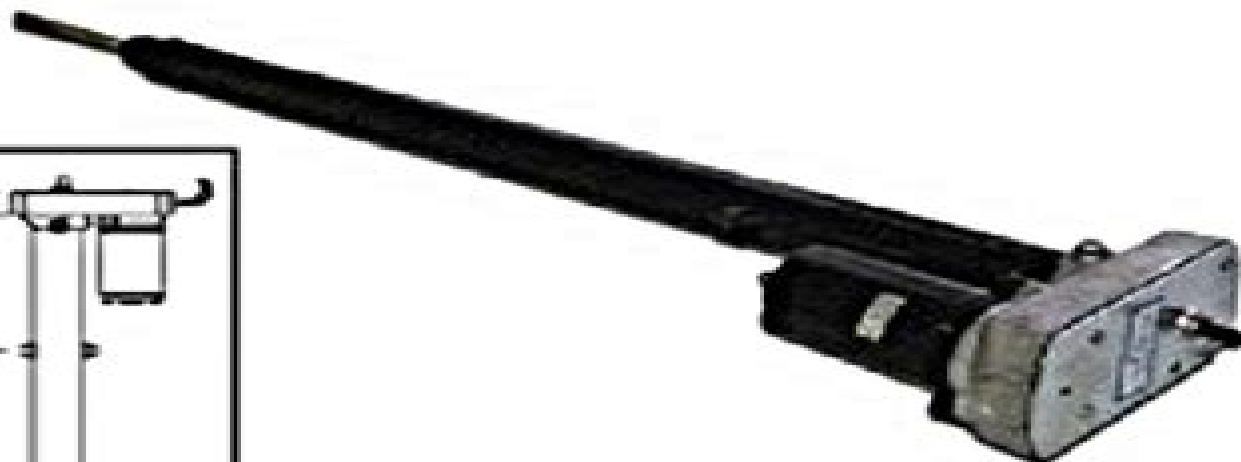
40° Venture Actuator with 18:1 High Speed Motor #014-168956