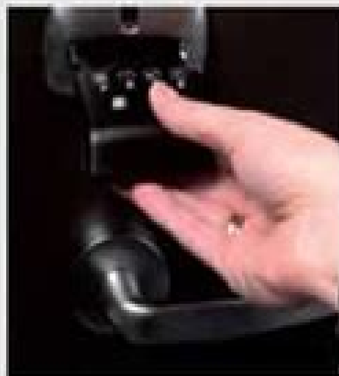
Upload/download lock information