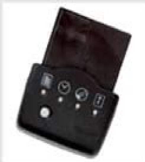
MiniLink to be purchased separately