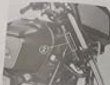
(2) Frame number

The engine number (3) is stamped on top of the crankcase.