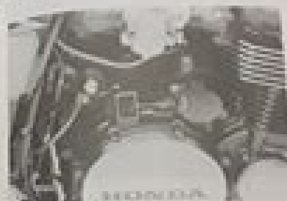
(3) Engine number