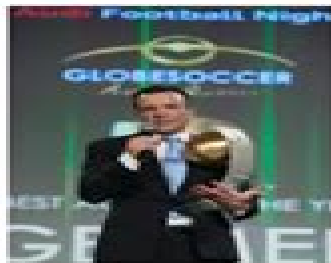
Jorge Mendes (Portuguese football agent)

They serve as professional representatives for athletes, helping promote their clients to future employers and representing athletes throughout the contract negotiation process. Agents also serve as liaisons between the athletes themselves and their financial affairs and legal teams.