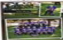
8x10 Memory Mate Plaque

Most items have the player's name printed on it. PRINT NEATLY!!!! Reprints due to poor penmanship is at your expense.