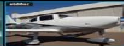
2013 Cessna 400 Corvallis TTx With Intrinsic Flight Deck & G2000 All Glass Cockpit! Speed, Comfort, Safety & Style! Secure Your SN Now. $733,950