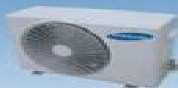
AQ12EWGN(X)SER AQ09ESGN(X)SER AQ12ESGN(X)SER