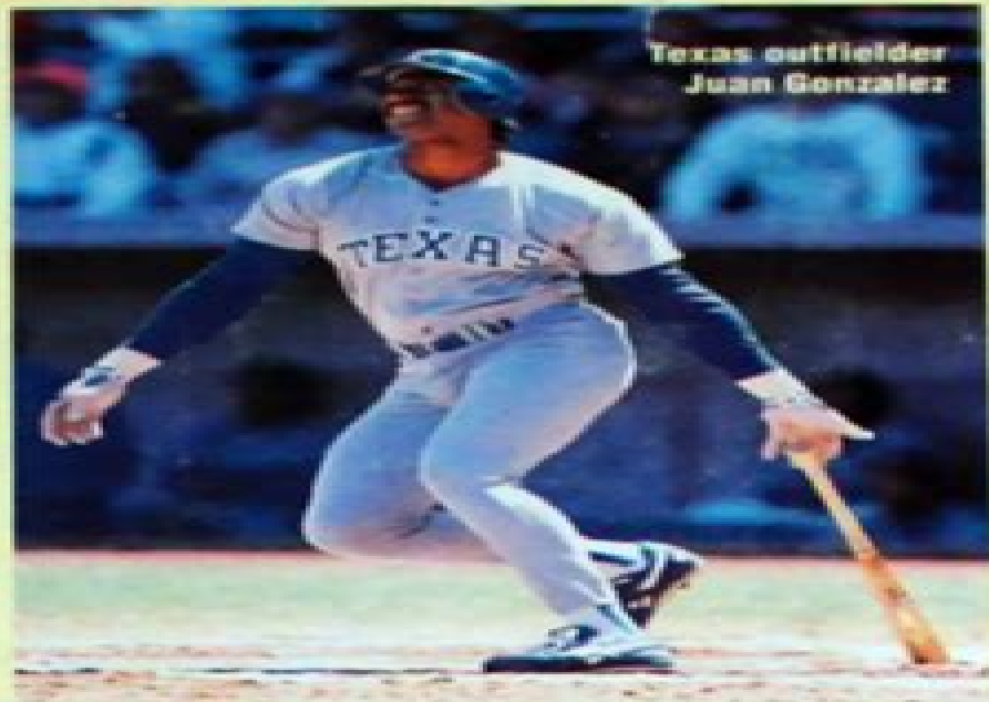
Texas outfielder Juan Gonzalez

With ALL THE STATS YOU'LL NEED to prepare for Rotisserie® and most fantasy baseball leagues!