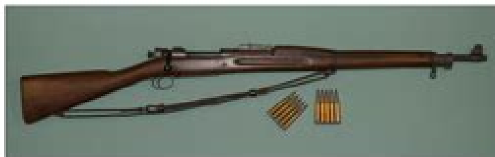
Springfield M1903 Rifle