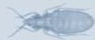
5TH INSTAR STAGE