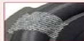
3-layer fibre woven radial surround: an extremely durable and high-performance radial surround

The whole range of new Pioneer subs is outfitted with a patent-pending 3-layer Fibre Woven Radial Surround design. The surround consists of two outer layers (rubber for the TS-W15000SPL) and one inner layer of interwoven fibre (Aramid fibre for the TS-W15000SPL) with a honeycomb weave for even distribution throughout the surround material. This eliminates weak points and improves the high power capability for an extremely durable and resilient surround that resists puckering, even under the extreme power conditions of SPL competitions.