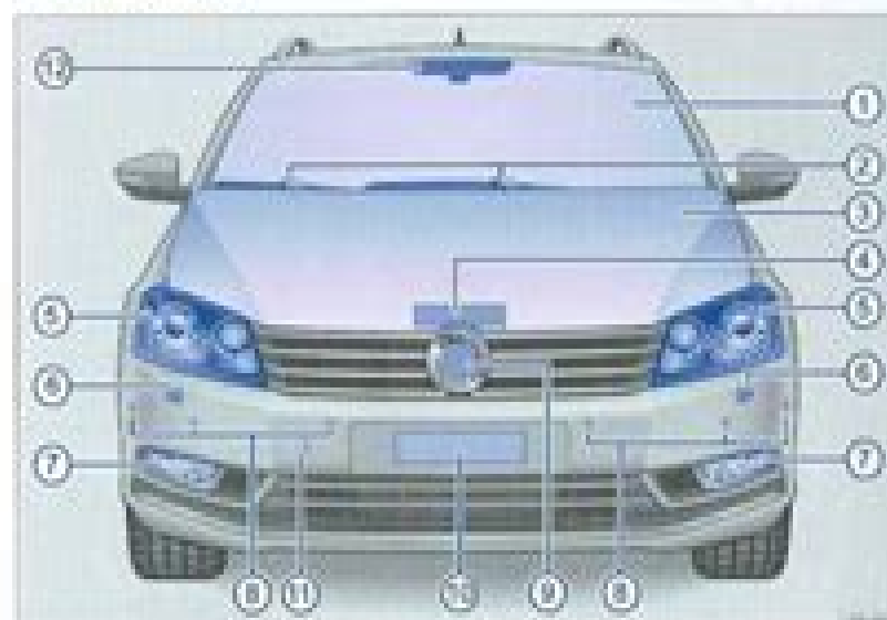
Rys. 2 Widok przodu samochodu