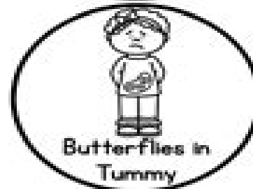
Butterflies in Tummy