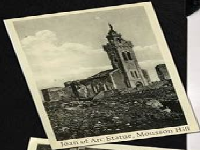
Joan of Arc Statue, Mousson Hill