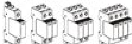
SLP20-XXX series, SLP40-XXX series FLP7-XXX series, FLP12.5-XXX series

AC surge protector - Parafoudre Basa Tension Protectiones Baja Tension Überspannungsschutz für Niederspannungnetze Scarcatori da sovratensione per rete di energia Protector de Surto CA - Svodící přepínací pro AC Трисківальник напруги на енергосетях Напіврозсіювач AC - 交流浪涌保护器