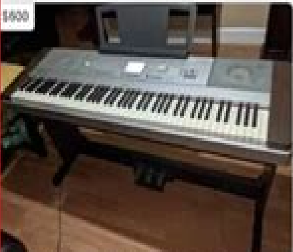
☆ Id: 1 Yamaha DGX_640 88 weighted key digital piano $600 (Baldwin) 📷