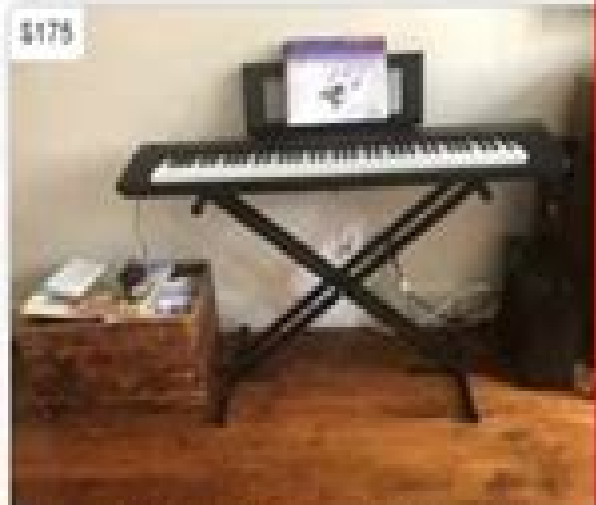
☆ Id: 1 Yamaha NP32 Portable Digital Piano With Stand And Power Supply $175 (Williamsburg, Brooklyn) 📷