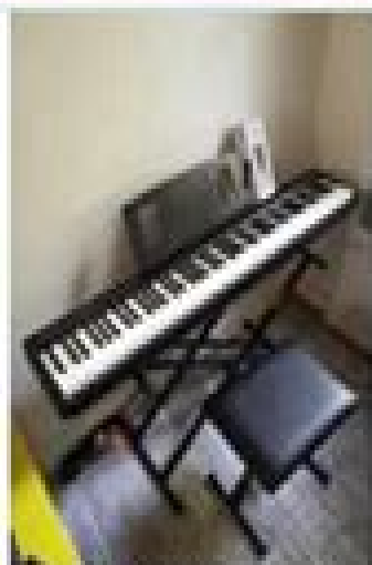
☆ Id: 1 Roland FP-10 88 Key Compact Digital Piano With Stand, bench and pedal $450 (Upper East Side) 📷