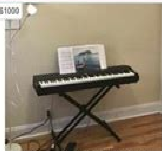
☆ Id: 1 Yamaha P255 88-Key Digital Piano with Pedal $1000 (New York) 📷