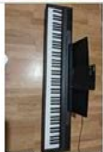
☆ Id: 1 Yamaha P105 88 weighted key digital piano $350 (Baldwin) 📷