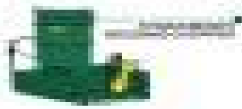
PTO-powered bedding chopper

For more information, contact your local distributor or write to: HYDRAULIC MOTOR BEDDING CHOPPER , P.O. Box 1000, [Address]