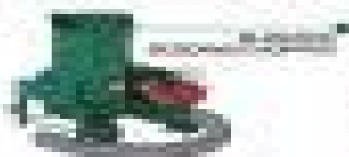
Electric-powered bedding chopper