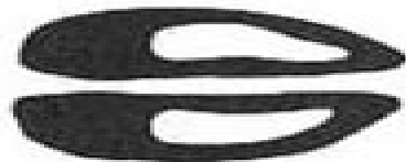
Red Deer (7cm)