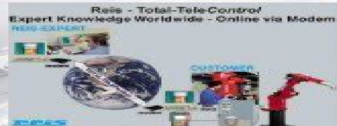
Total-Tele-Control – fast and professional support with remote diagnostics via modem and PC.