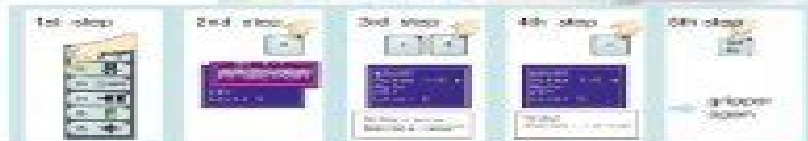
RobAssist – an application-related programming and operating tool.