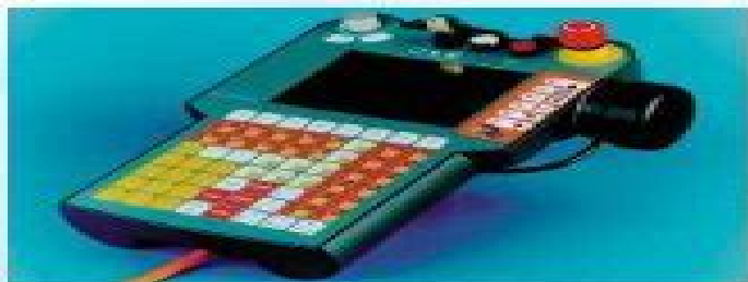
Ergonomic portable teach pendant – with all functions for operation and programming