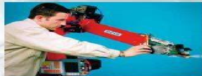
6D-mouse on the robot for easy programming and operation.