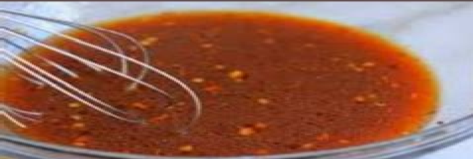
Sweet and Sour Sauce