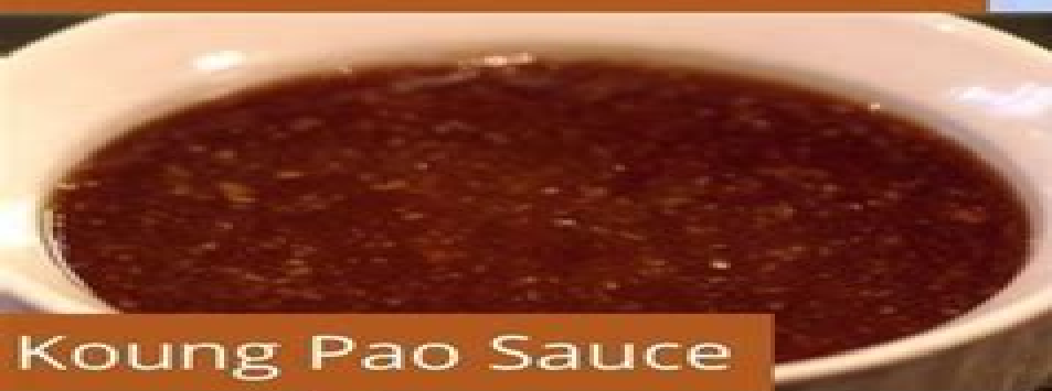
Koung Pao Sauce