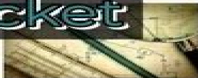
Unit 5: Semester Wrap-Up