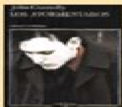
Los Atomizados John Connolly $299

» El efímero John Connolly ha ganado seguidores y reconocimiento crítico a la largo de los últimos 10 años con sus novelas negras protagonizadas por un detective al que bautizó Charles Parker. Con lo que desea una vocación tanto para las novelas y acertas como un gusto por el jazz. En su nueva entrega, Parker persigue a un tal Méndez, quien acosa a la hija de un pequeño niño desaparecido después de serlo descubiertos los abusos contra sus padres. Un libro imprescindible.