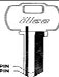
5 pin 1054WC (2) 6 pin A1054WC (1)