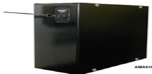
Figure 7: Engine Reset Switch

The engine is protected by a reset switch. When the reset switch opens the engine will shut down. Typical causes for an open engine reset switch are low oil pressure, high water temperature or an engine start failure. The engine reset switch is located on the side of the Interface Board control box enclosure.