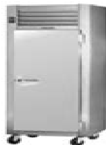
Model RLT132WUT-FHS (shown with optional casters)