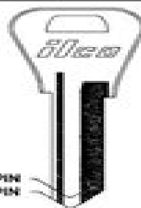
5 pin 1054WB 6 pin A1054WB