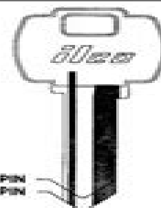
5 pin 1054WC (2) 6 pin A1054WC (1)