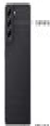
On the phone, select Settings

For more information about the phone, select Settings on the phone or visit Samsung.com/support for more information. Visit Samsung.com/support for more information.