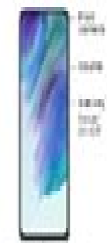
On the phone, select Settings