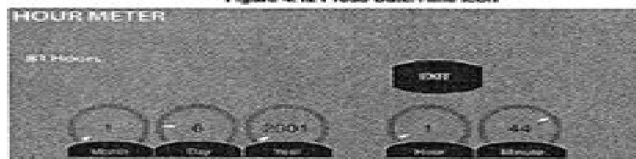
Figure 4.13 Date/Time and Hour Meter screen

To adjust the date and time, select by pressing the touch screen directly over the control to be adjusted (see figure 4.14).