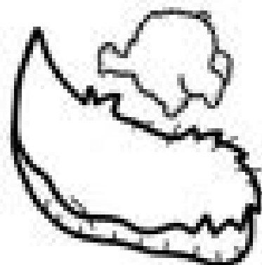
Biting, biting everywhere!