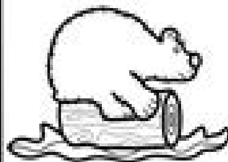
Bear and Flea floating out to sea