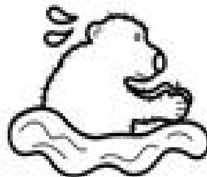
Bear saves Flea