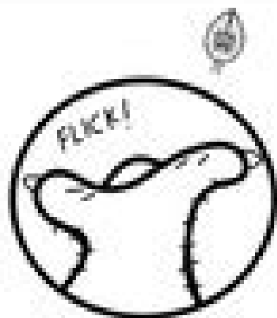
Bear flicking Flea out to sea