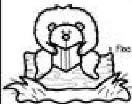
Bear is reading