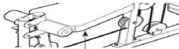
Serial Number Decal (Under Seat)

Write the serial number in the space above for future reference.