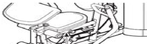
Serial Number Decal (under seat)

Write the serial number in the space above for future reference.