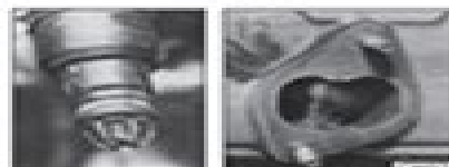
How to reduce typical carbon deposits (found on fuel injectors and intake valves) that can cause drivability problems. Engine Management—Drivability, page 7