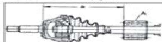
Detailed view showing correct spacing (A) between constant velocity joint and axle vibration damper (B). Suspension and Steering, page 22