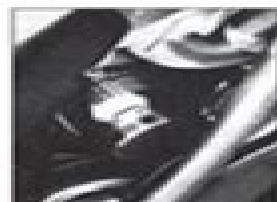
See how to perform routine maintenance procedures, such as changing the oil filter. Lubrication and Maintenance, page 10

Though the do-it-yourself Volkswagen owner will find this manual indispensable as a course of the detailed maintenance and repair information available at an authorized Volkswagen dealer, the Volkswagen owner who has no intention of working on his or her car will find that reading and owning this manual will make it possible to discuss repairs more intelligently with a professional technician.