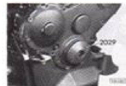
Fig. 3 Timing cover - Installing Secure with 2025.