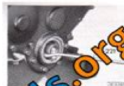
Fig. 1 Crankshaft pulley - Removing