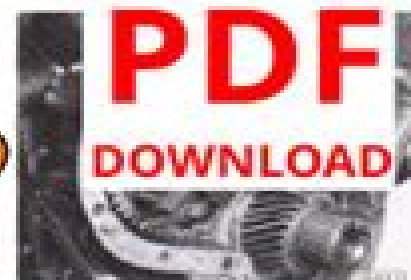
Fig. 4 Timing gear - Removing The support in arrow below about 5 mm.