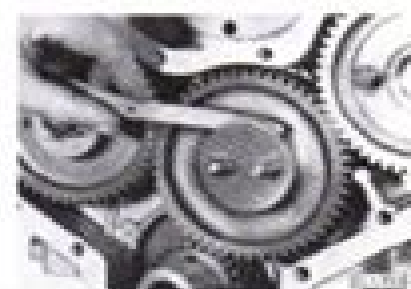
Fig. 5 Timing gear - Checking axial play New: 0.15 - 0.20 mm Used: 0.20 mm