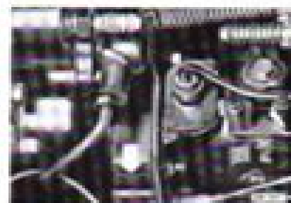
Fig. 6 Timing gear - Installing The marks on the pump and the timing housing must be aligned. Pump push and drive hub fit in one position only.