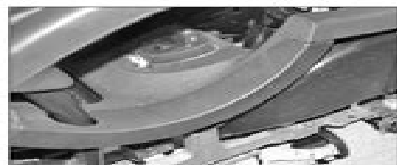
27.7 Prise up the panel beneath the handbrake lever

5 On manual transmission models, release the clips and detach the gaiter and frame from the surround trim (see illustration).