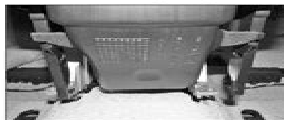
27.11a Lift the air duct from its mountings, and pull it rearwards