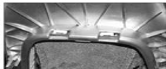
27.5 Unclip the gear lever gaiter/frame from the trim