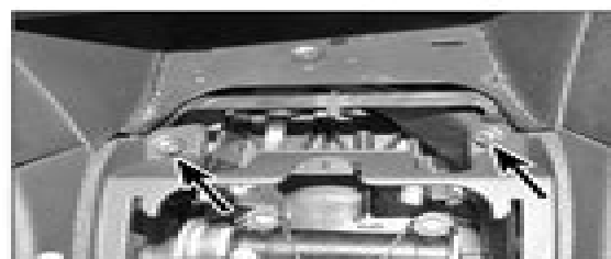
27.10a Undo the 2 Torx screws at the front of the console (arrowed) . . .