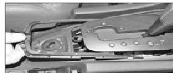
27.6b . . . and slide out the retaining frame