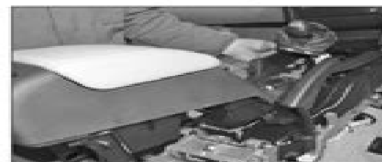
27.11b Lift the rear of the console and manoeuvre it from place