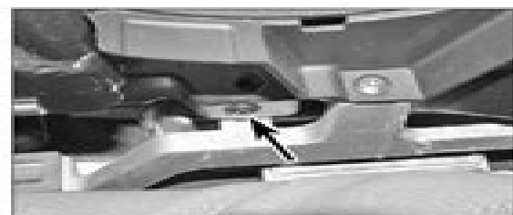
27.10c On some models, remove the screw each side (arrowed)