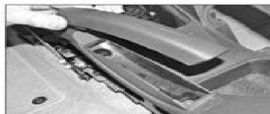
27.8a Lift up the cover . . .

6 On automatic transmission models, undo the Torx screw, lift the rear of the selector