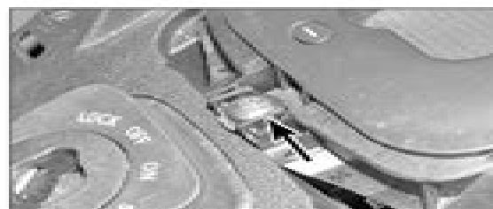
27.6a On automatic transmission models, undo the screw (arrowed) . . .