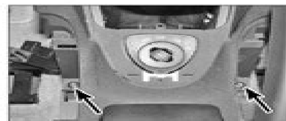
27.10b . . . and the screw each side (arrowed)