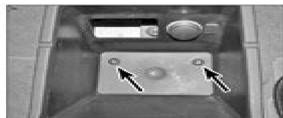
27.9 Undo the 2 Torx screws in the storage box (arrowed)

9 Lift up the rubber mat in the storage box, and undo the 2 retaining screws (see illustration).