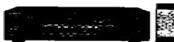
Black, Silver, and Golden models