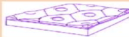
B. Simple squamous epithelium