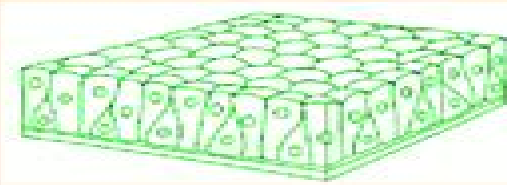
C. Pseudostratified columnar epithelium