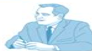
Joseph F. Sutter Designer of the 747 Series

The 747-400 is the world's largest commercial aircraft, with a capacity of 416 passengers in a single-class configuration. The 747-400 is the world's largest commercial aircraft, with a capacity of 416 passengers in a single-class configuration.