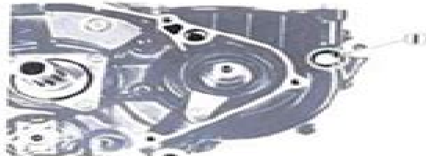
1. Blind plug

Tighten the securing bolts on the crankcase separating tool, but make sure the tool body is parallel with the case. If necessary, one screw may be backed out slightly to level tool body.