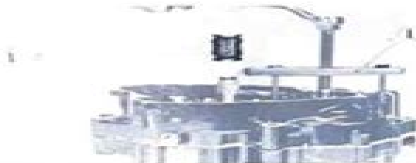
1. Crankcase separating tool

Tighten the securing bolts on the crankcase separating tool, but make sure the tool body is parallel with the case. If necessary, one screw may be backed out slightly to level tool body.