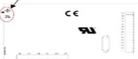
Fig. 2 Reverse of 704

A key to all configuration options is provided overleaf on the Functions and Parameters table.