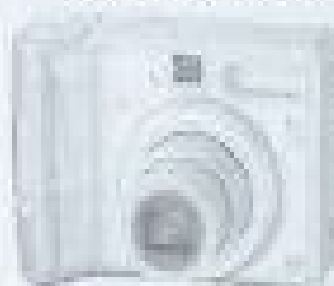
Photo of PowerShot A540