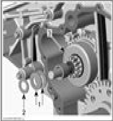
FIGURE 1 Disc springs Thrust washer Starter drive

NOTE: Be careful not to loose the disc springs and thrust washer located on the starter drive shaft.