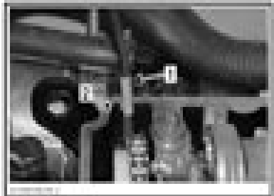
FIGURE 1 1. Suction pump tube 2. Edge of cylinder head