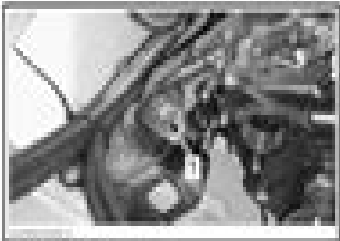
FIGURE 1 PTO housing removal 1. Rear engine support screws