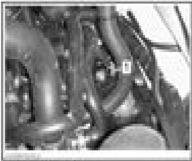
FIGURE 1 Rear side of engine 1. Rear engine support screws