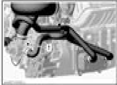
FIGURE 1 1. Water pump housing