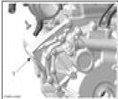
FIGURE 1 1. Engine support