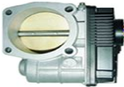
electronic throttle body