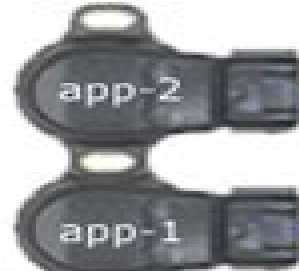
accelerator pedal position sensors