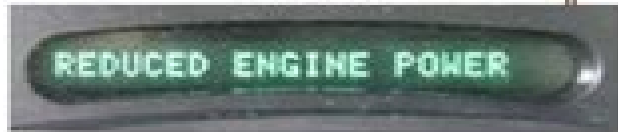
instrument panel cluster