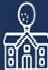
Group D Private Clubs