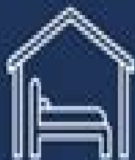
Group A Accommodation