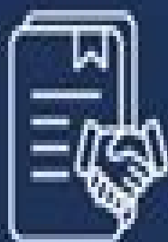
Group G Professional Services