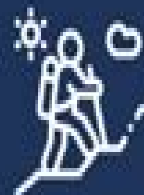
Group E Sports & Recreation