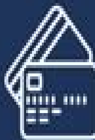
Group H Credit Card & Charge Card