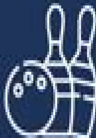
Group C Entertainment & Leisure