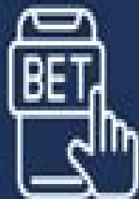
Group F Betting & Gaming