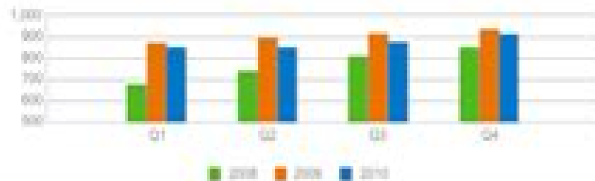
Quarterly Projected Sales (000)