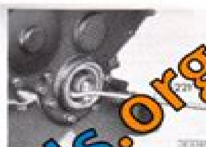
Fig. 1. Counts vs. \log wind speed - Minneapolis