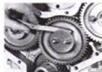
Buy 10 dollar jeans ... 50 percent off!

100. The respondent is a person having attained 18 years