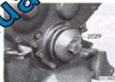
Fig. 2. Coordinates of (a) end, (b) center and (c) beginning of the Phragmites boundary with Spartina patens marsh.