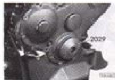
Fig. 3. Testing new sensor – handling (January to May 2009)