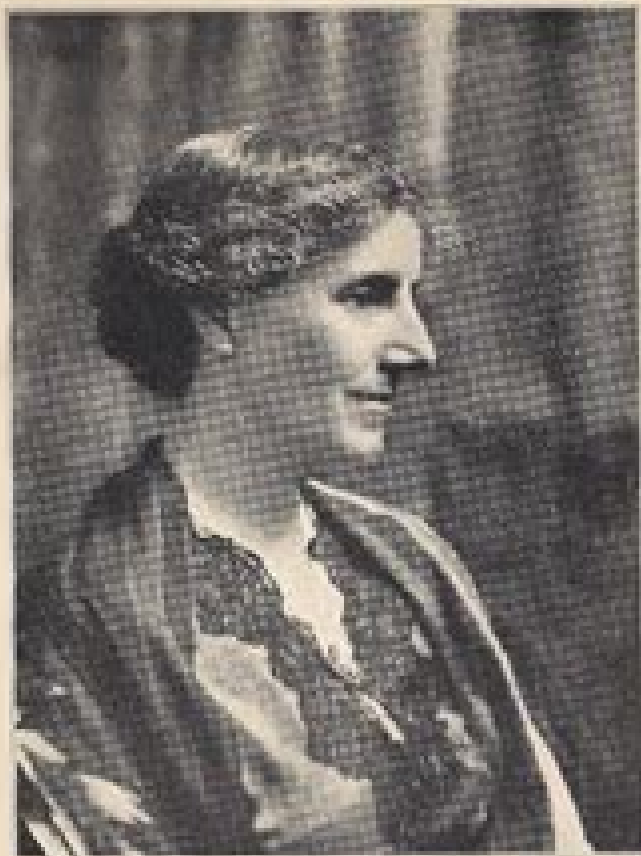
CHARLOTTE PERKINS GILMAN