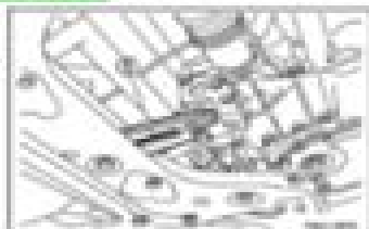
Figure shows A/T models. The shape of the bracket on the transverse side is different for M/T models.