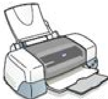
Stylus PHOTO 890